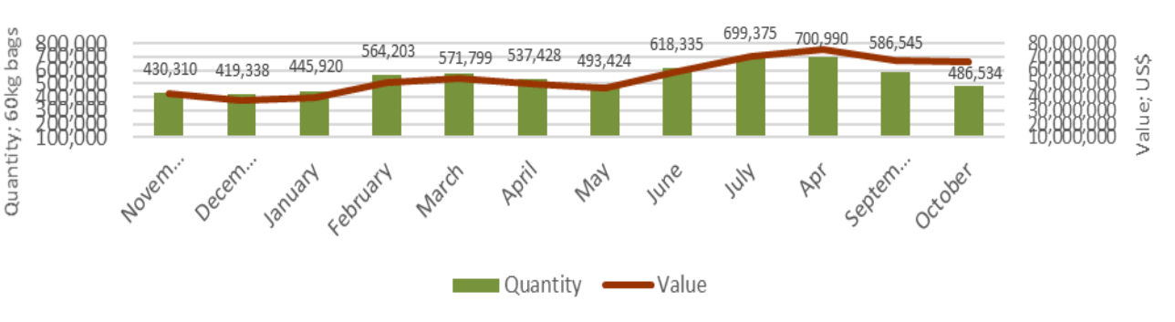
Table1: Comparison of Coffee Exports of October 2020/21 and 2021/22 Coffee Years